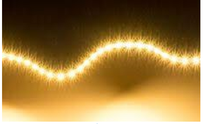
Note of caution as per § 3.4 of the DFF bylaws (www.displayforum.de)

As DFF meetings are not covered by mutual NDAs, the DFF advises its members as well as every participant at DFF meetings to check and carefully select - in their own interests - all information provided in presentations or discussion of any kind.